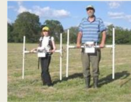
Magnetometry for all ages

Recent & current fieldwork projects currently cover archaeology from the Bronze Age to the Tudor & Georgian periods, via the Romans! Experts & complete beginners of all ages are warmly welcomed. Informal instruction in basic field archaeology is provided.