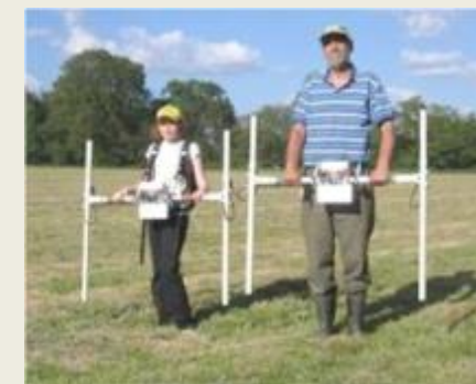
Magnetometry for all ages

Recent & current fieldwork projects currently cover archaeology from the Bronze Age to the Tudor & Georgian periods, via the Romans! Experts & complete beginners of all ages are warmly welcomed. Informal instruction in basic field archaeology is provided.